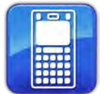
HAND HELD TERMINAL